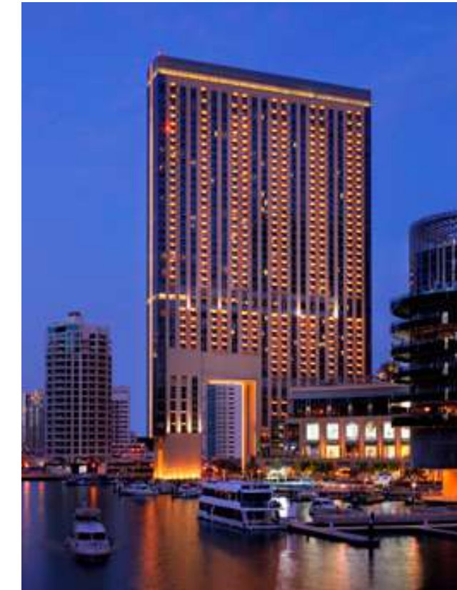
The Address Dubai Marina 5-star Premium Hotel

Famous for its vibrant nightlife, exceptional dining venues and an abundance of activities that will satiate your every desire.