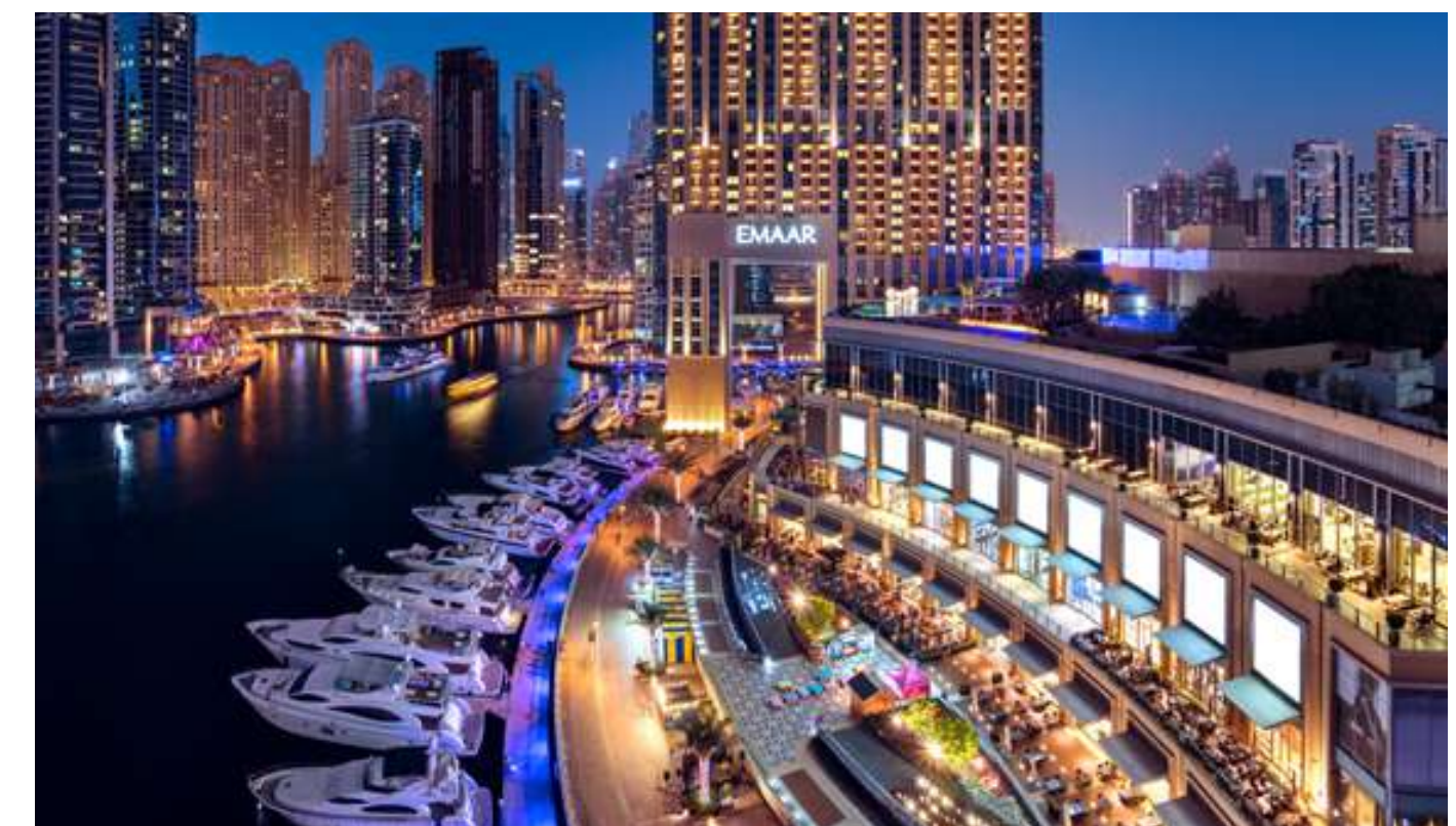
Dubai Marina Mall