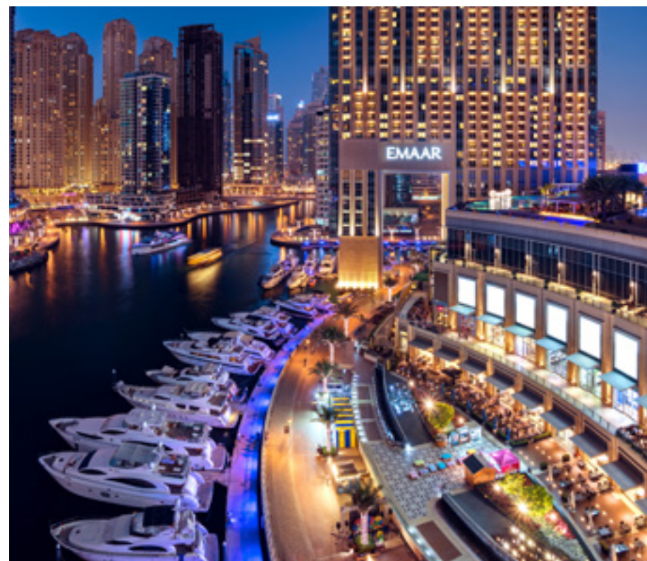
150,000 Sqm Marina Mall